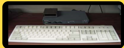
Figure 2 White Keyboard